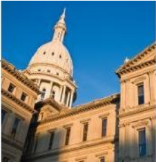
EXHIBIT G ELECTION POLICY