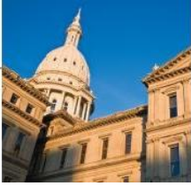
EXHIBIT D SAMPLE AUTHORIZING RESOLUTION

WHEREAS, certain governmental units described in Schedule 1 attached to this Resolution (the "Public Agencies") desire to enter into or have entered into an interlocal agreement substantially in the form attached hereto as Exhibit B (the "Participation Agreement") for the purpose of exercising jointly the power each Public Agency has to invest its surplus funds; and